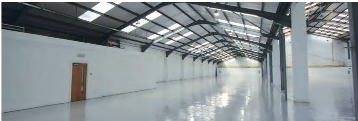
Typical example of a Hermes Real Estate refurbishment.

Each party to be responsible for their own legal costs incurred in the transaction.