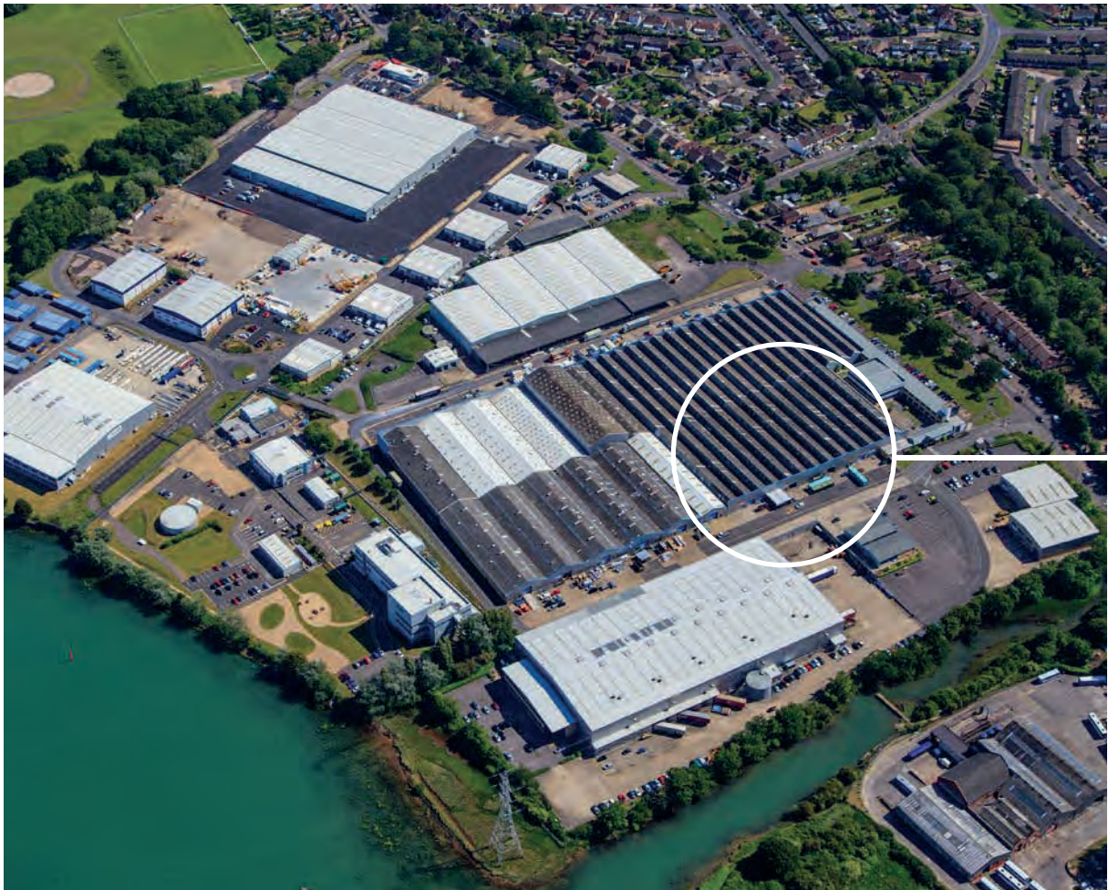
Aerial photograph of Fareham Reach Business Park looking south west.