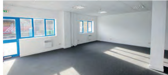
Typical example of a Hermes Real Estate refurbishment.